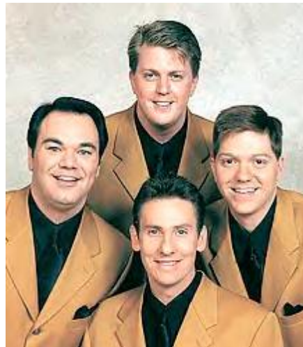
Michigan Jake 2000 International Quartet Champions