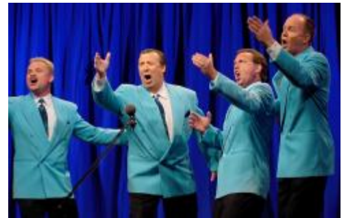
Excaltibur International Quartet Finalists

featuring 6 time International Medalist Great Northern Union Chorus singing a story of college days