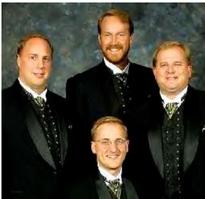
Bravo! 2001 Land o' Lakes District Champions