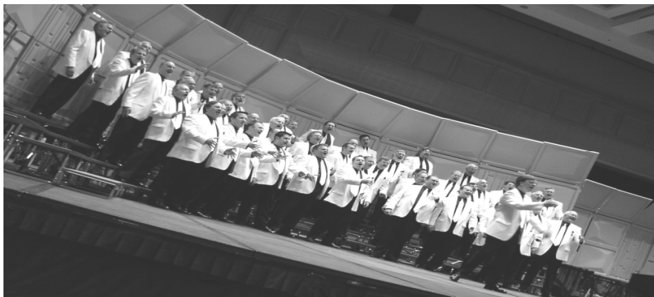
The Great Northern Union Chorus sings at the Minnesota Music Educators statewide conference, February 15 th . Even though GNU sang late in the evening, those who stayed enjoyed a great performance.