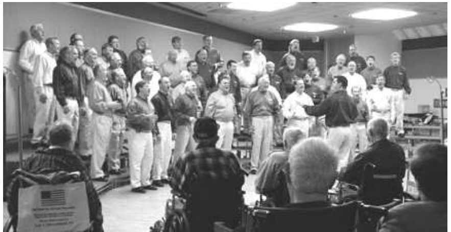
The Great Northern Union sings at the Veterans Hospital.