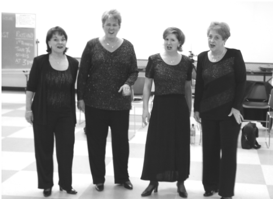
Montage sings at a recent GNU rehearsal