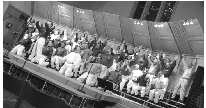
GNU at the Northfield Winter Music Festival