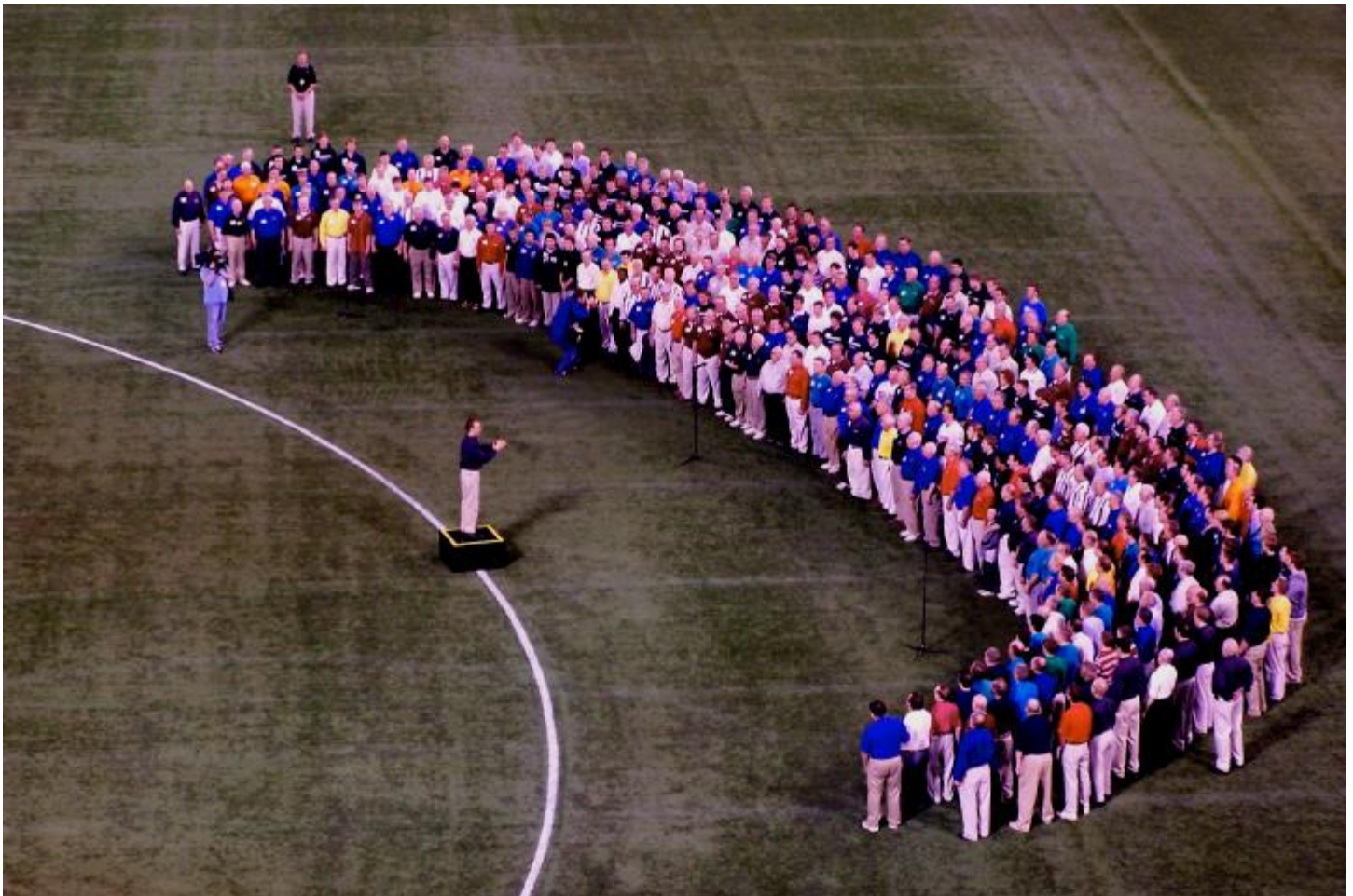
The 355 man Barbershop chorus singing on the Metrodome field